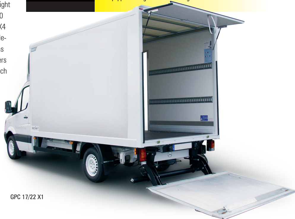
GPC 17/22 X1

For information on the latest configurations, visit www.maxonlift.com/products/conventional .