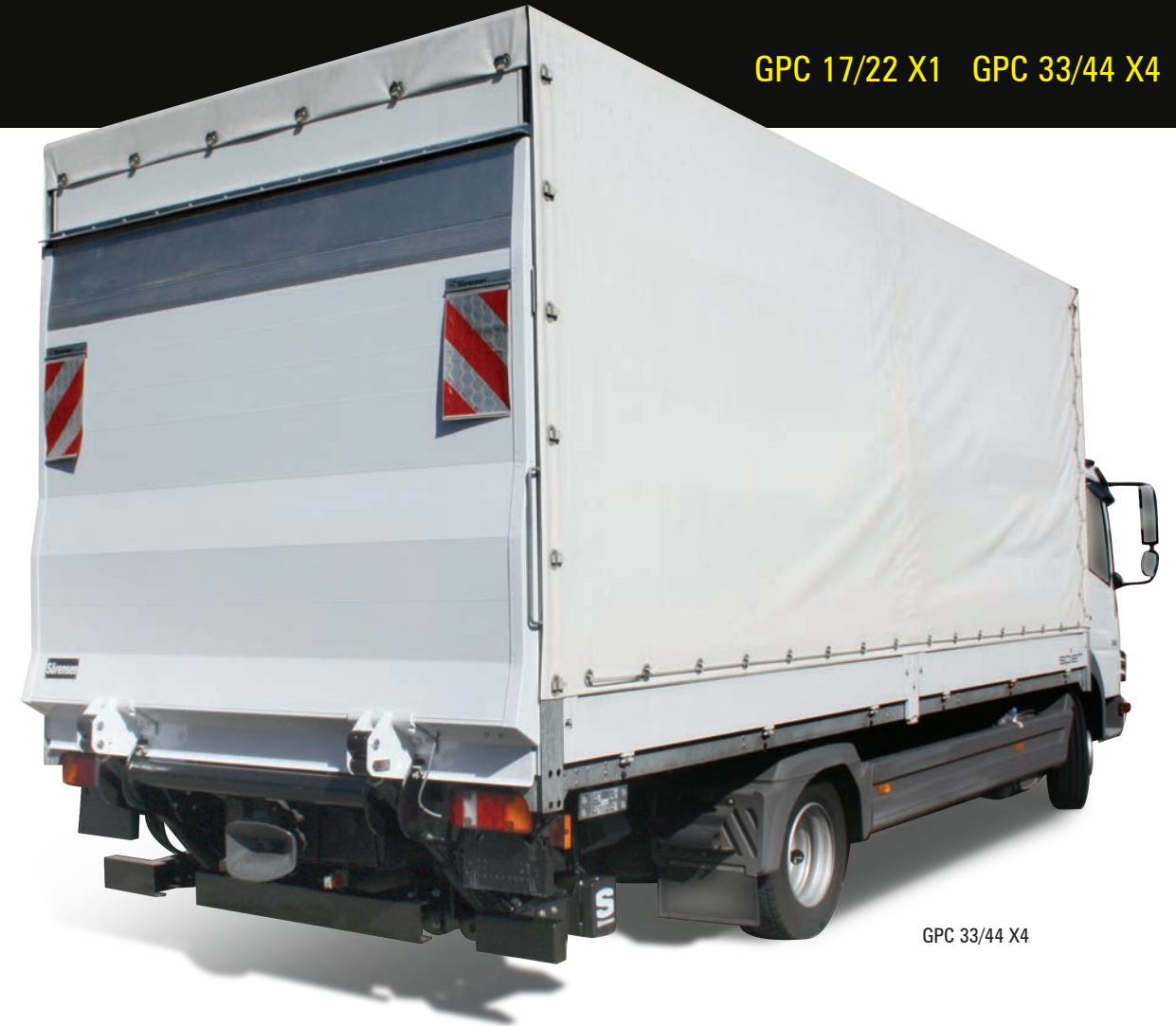
GPC 33/44 X4